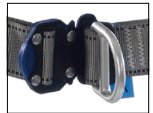
Quick-release fastener with climbing protection eyelet (chest), made of forged steel.