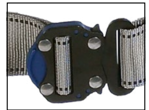
Quick release buckles (steel)