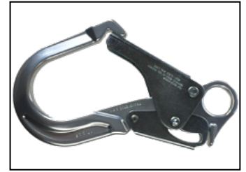
IKV 55 (EN 362:2004-T)