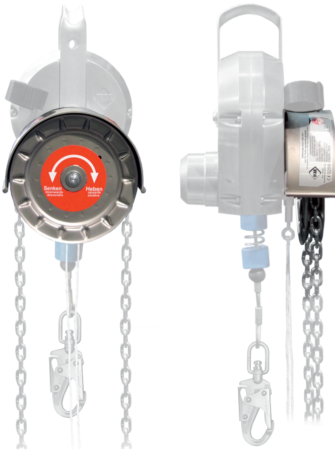
Img: Chain hoist drive (S30) on one IKAR high-safety device (HRA 12)