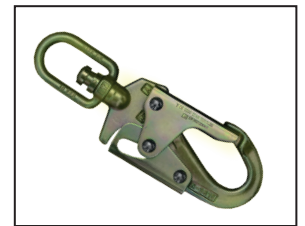
IKV 33 (ANSI Z.359.1-2007; CSA Z259.12-2011) with fall indicator