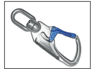
IKV 21 (EN 362:2004-T) with fall indicator