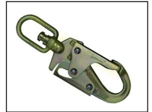
IKV 33 (ANSI Z.359.1-2007; CSA Z259.12-2011) with fall indicator