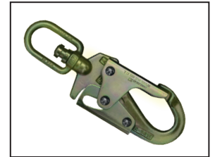
IKV 33 (ANSI Z.359.1-2007; CSA Z259.12-2011) with fall indicator