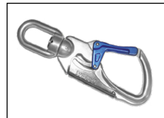
IKV 21 (EN 362:2004-T) with fall indicator