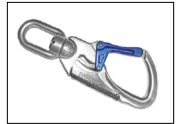
IKV 21 (EN 362:2004-T) with fall indicator