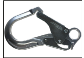
IKV 55 (EN 362:2004-T)