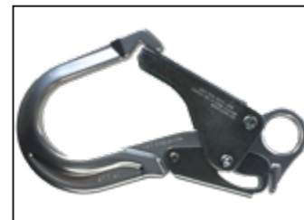
IKV 55 (EN 362:2004-T)