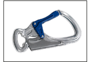
IKV 11 (EN 362:2004-T)